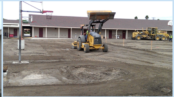
Sacred Heart Playground Project