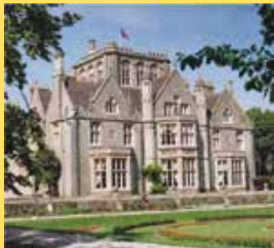
Tortworth Court Four Pillars Hotel, Tortworth Glos, GL12 8HH, (just off junction 14, M5).

Marking the mid-term stage of the Grand Charity Festival, the evening will include a splendid meal together with superb cabaret entertainment.