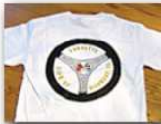
Logo on back of T-shirt