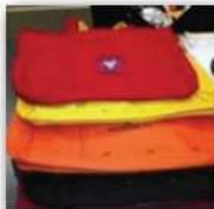
Tote Bag $20