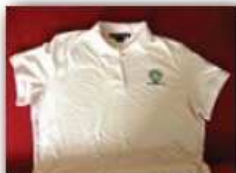
Polo Shirt $40 (Order Item)