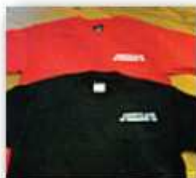
T-Shirt $16 (S-XL) $17, $18 (2X, 3X)