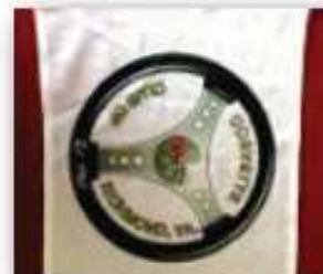
Flag 1 for $13 2 for $25