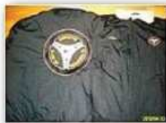
Jackets $113 S, M, L, XL (2XL-4XL extra$) (Order Item)