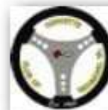
Club Logo Window Sticker (Small, Round) $3