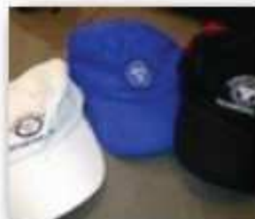
Baseball Cap $15