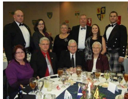
An event rich in family ties, Scottish food, music, and fellowship!

The musical entertainment this year is Guilderoy Byrne . This group performs traditional and contemporary songs, tunes, and stories. Their music includes Celtic and International selections played on a variety of acoustic folk instruments !