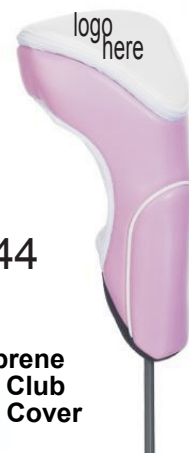
Neoprene Golf Club Head Cover