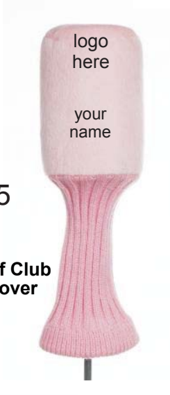
Knit Golf Club Head Cover