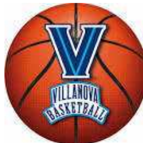
Signed Villanova basketball