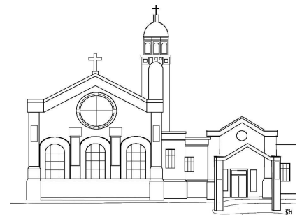
St. Raphael, Springfield