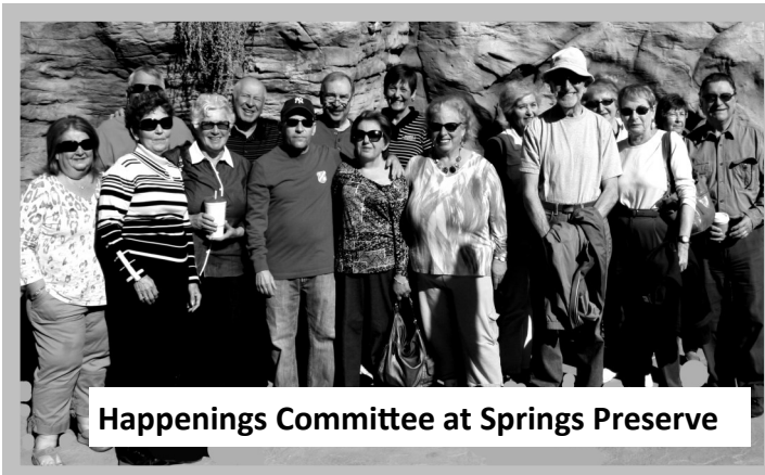
Happenings Committee at Springs Preserve

We look forward to a busy year filled with a visit to the Mob Museum with a guided tour; a fun trip together by bus to Tuacahn to see “ Beauty and the Beast ”, and an another amazing BKB Picnic in October with great food and entertainment. We may even travel north to Moapa to walk among the exotic animals at the Roos ‘n Moor Zoo . Have you