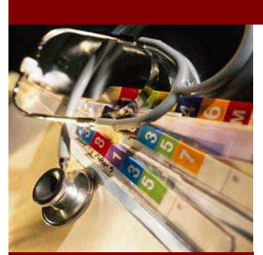
Chart Auditing is essential to risk reduction, compliance and a healthy bottom line∞

Auditing provides proof of services rendered and lends assistance to areas in need of improvements