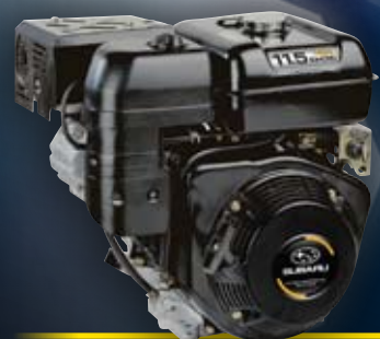
OHV SLANT CYLCINDER