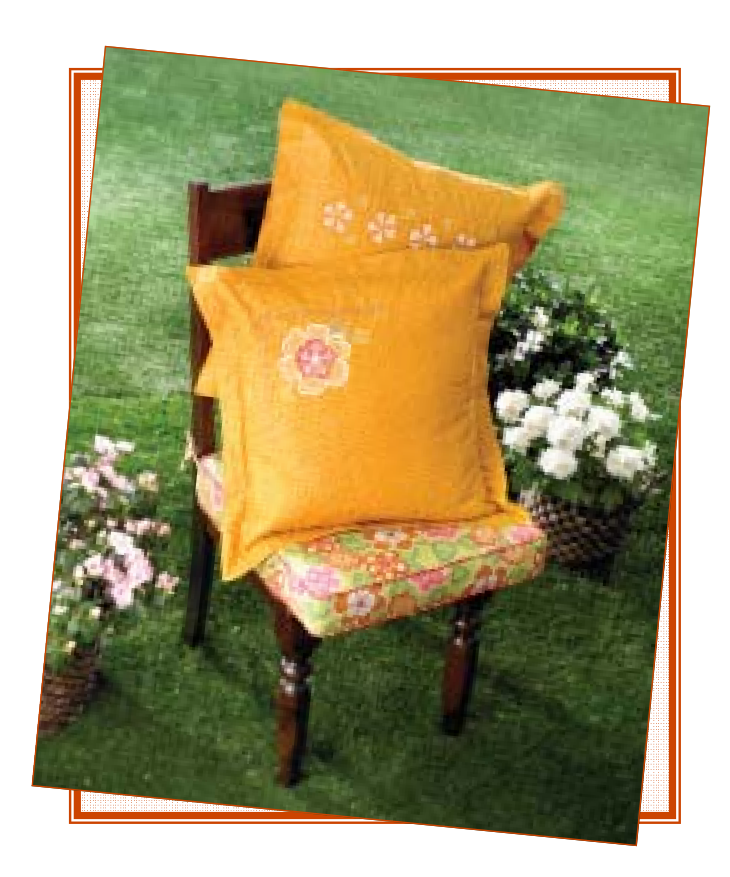
Visit www.berninausa.com Projects • Product Information • Promotions

Note: The Mega Hoop is convenient for long designs such as the border design shown on the pillow in the background.