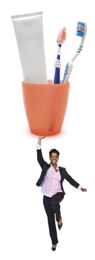
Your dental benefits do not have deductibles or any annual maximum dollar benefit limitations.

Copayments are your share of costs for covered services and are paid to the dentist at the time of care. Simply present your Health Net Dental member ID card to the participating primary dentist you selected. It's that simple!