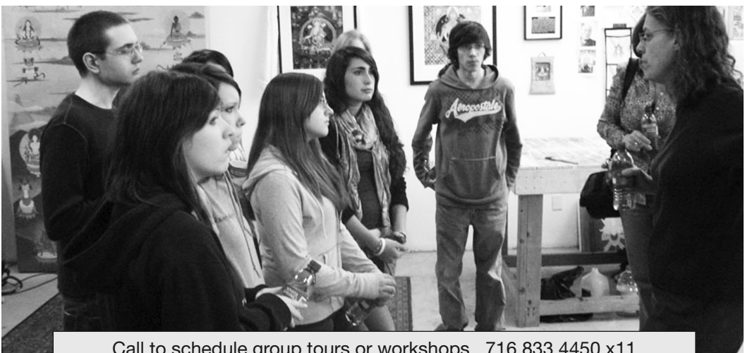
Exhibit runs through March 6, 2010

Call to schedule group tours or workshops 716.833.4450 x11