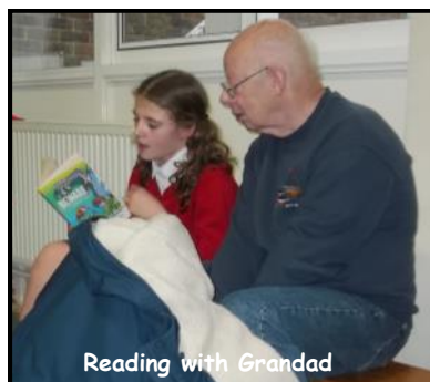
Reading with Grandad