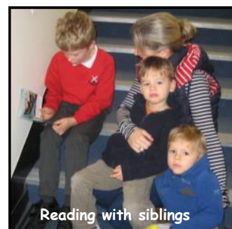
Reading with siblings