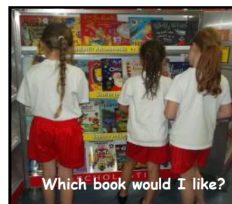
Which book would I like?