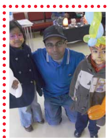
Fun and support at a family weekend

The funded projects are incredibly varied. Some will look at a particular stage of the journey, for example Together for Short Lives will look at helping young people come to terms with the fact that their condition is severe enough to shorten their life. Others will focus on a particular group, for example Sebastian's Action Trust will use the funds to help support fathers of seriously