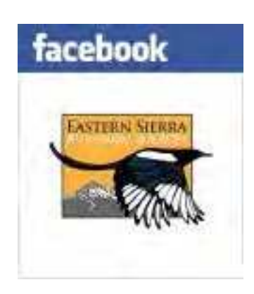
Join us on Facebook!

You can find a list of our current ESAS Board Members and Committee Chairs here.