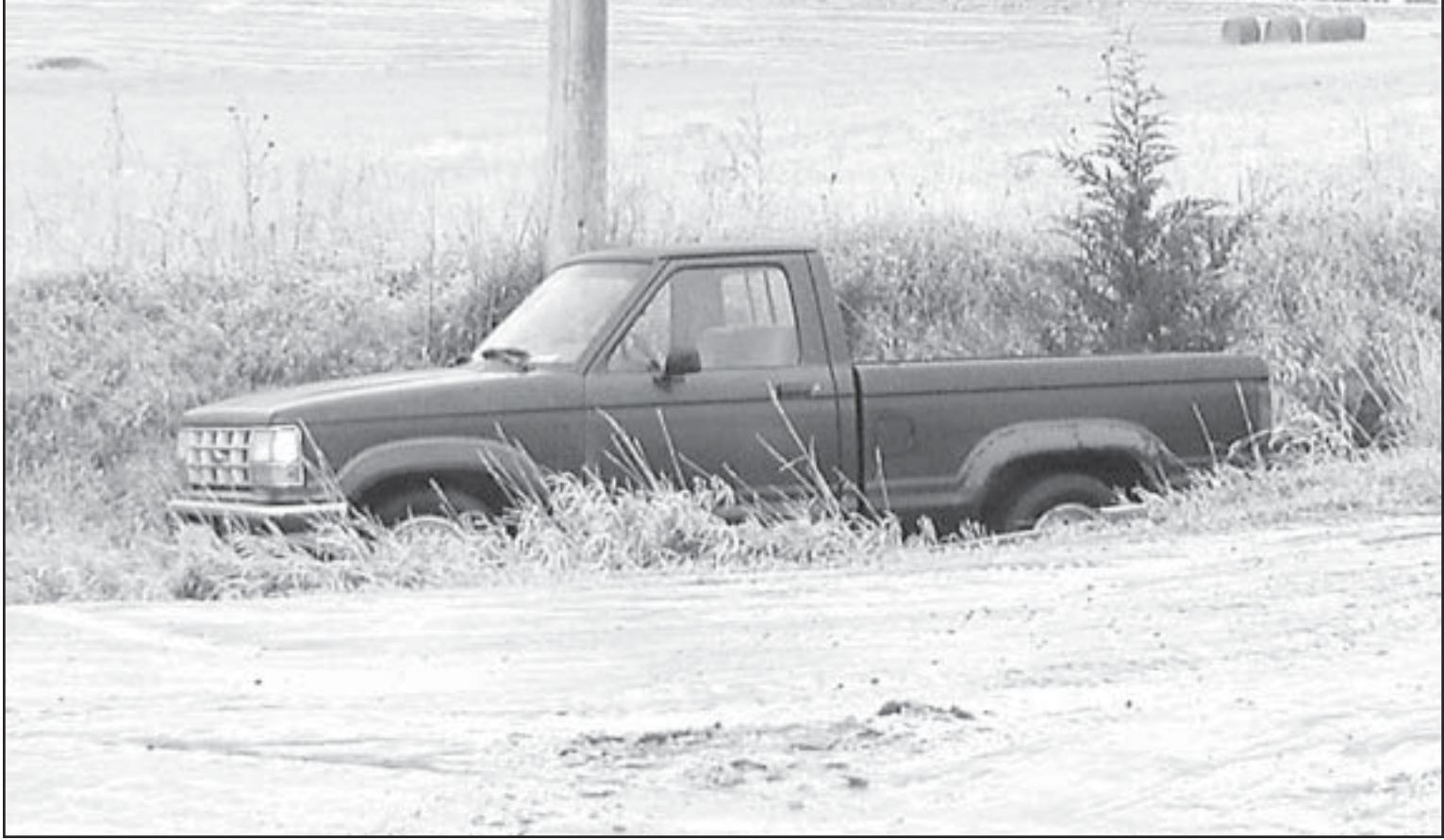
day and Tuesday nights were post- An ice storm on Sunday cause roads in the area to turn found the ditch on west Washington, where the road is into skating rinks. A pickup missed the stop sign but steep in all directions.

Although both the Norton and Northern Valley schools were closed on Monday for teacher in services other districts in the area including Oberlin were closed on Monday because of the bad weather. All area schools were closed again today because of the storm and dangerous roads. At press time the Norton vs. Oberlin game had not been re-scheduled. The basketball games scheduled for Northern Valley at the Cambridge Tournament on Monponed until Thursday.