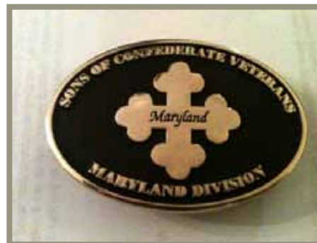
Belt buckles are numbered and guaranteed against breakage.

You do not have to be an SCV member to purchase.