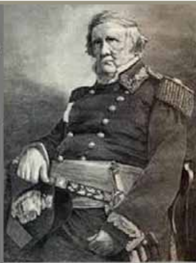
General Winfield Scott