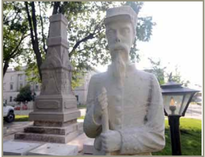
The Civil War monument located on the lawn of the Madison County Courthouse is still under repair. The eastbound lane of Main Street between South Highland Avenue and Liberty Street is closed.