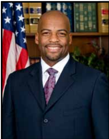
Assemblyman Isadore Hall III, D-Compton

California is looking to bar the "Stars and Bars."