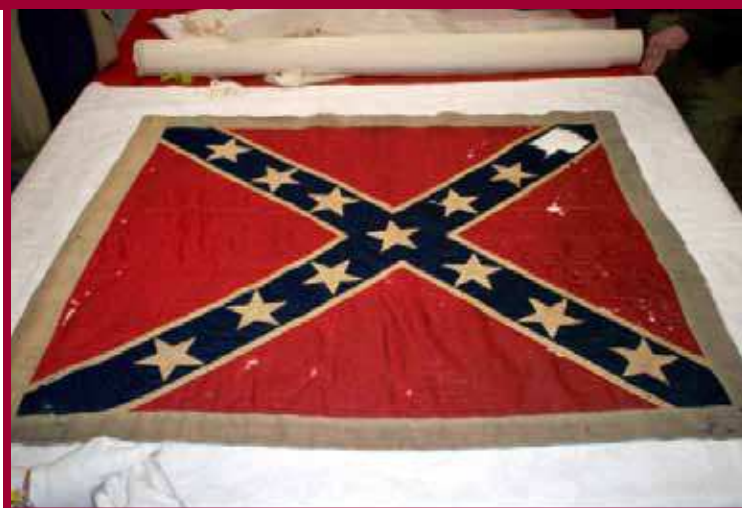
The 6th Regiment's Battle Flag which was captured at Sailor's Creek, VA, April 6, 1865. Cedar Fork Rifles Preservation Society, Inc

"I'm astounded at how many people give money to these efforts because they know they have a family connection," he said. "People still remember the suffering and loss and want to keep family memories alive."