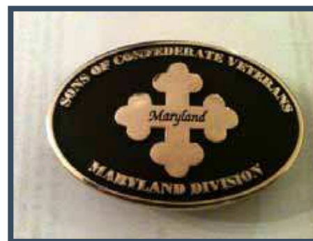
Belt buckles are numbered and guaranteed against breakage.

You do not have to be an SCV member to purchase.