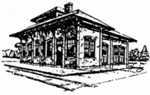
Interurban Depot • 1908