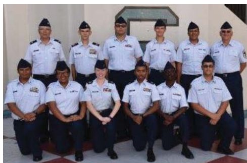
Central Florida Cadets attend Leadership Training at Citadel

Last June, Wekiva cadets engaged this highly beneficial development program for both cadre and rookie cadets.