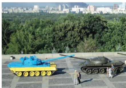
Ukrainian and Russian tank standoff at Kiev's War Memorial

authorized chaplaincy so local volunteer pastors have become chaplains for their military. With no pay, benefits, or medical care, these local pastors are serving without much training or experience in combat related ministry.