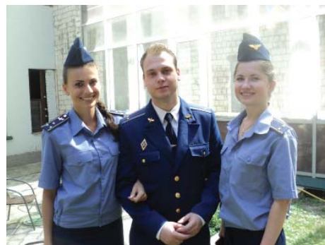
Ukrainian Air Force Officers