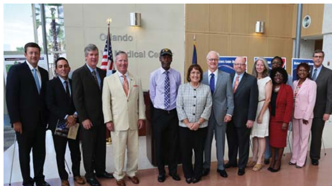
"Surge" officials meet with VA to help homeless Vets

While these VA programs help many of our homeless Veterans, the VA still employs stop-gap measures, such as providing temporary shelter while a Veterans awaits permanent housing, but there are better temporary solutions within the local