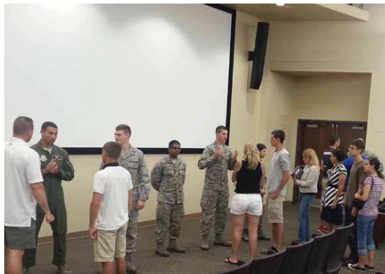
UCF AFROTC Det 159 Cadets share during Q & A time

This event is held each year on the first Sunday of the Air Force Academy Spring Break. This timing allows current USAFA cadets, from the Central Florida area, to join-up with AFROTC cadets from