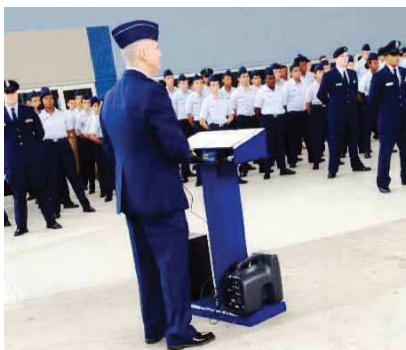
Dr. Phillips AFJROTC Pearl Harbor Day Remembrance

The structure of these programs provides opportunities for students to become “citizens of character, dedicated to serving their nation and community.” Students learn the core values of integrity, excellence, service. An example of the type of activities AFJROTC cadets plan, organize and participate in is the Pearl Harbor Day ceremony conducted at Dr. Phillips High School (pictured left and below).