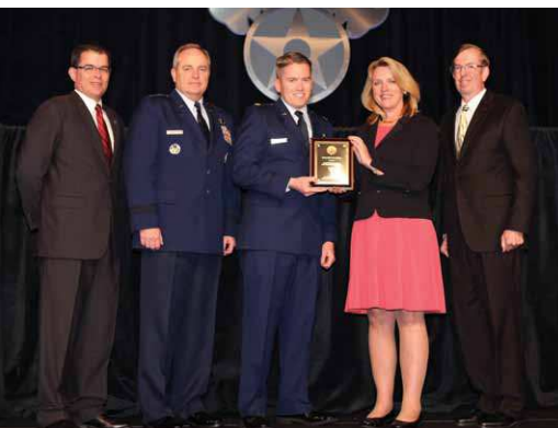
Air Force Air Battle Manager