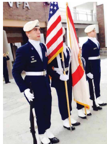
Dr. Phillips AFJROTC Honor Guard presentation of colors

The Central Florida Chapter is pleased to support the AFJROTC programs with a stipend and to attend their annual award ceremonies.