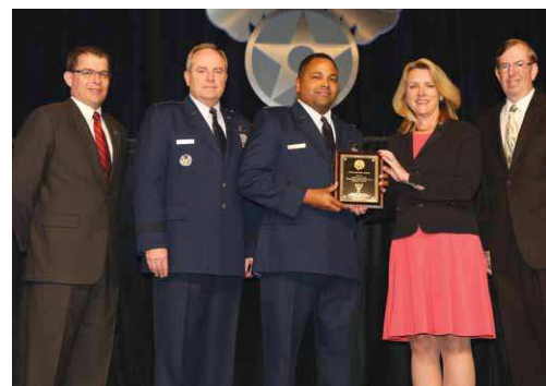
CAF Weapons and Tactics Conference