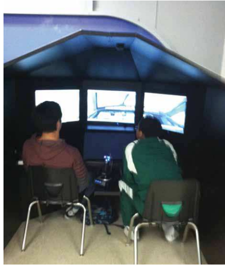
Oak Ridge High School Aviation Magnet Simulator