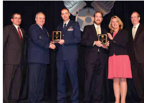
ACC/A3 and Georgia Tech Research Institute recipients