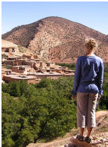
Information updated 29/7/2010 (AF)