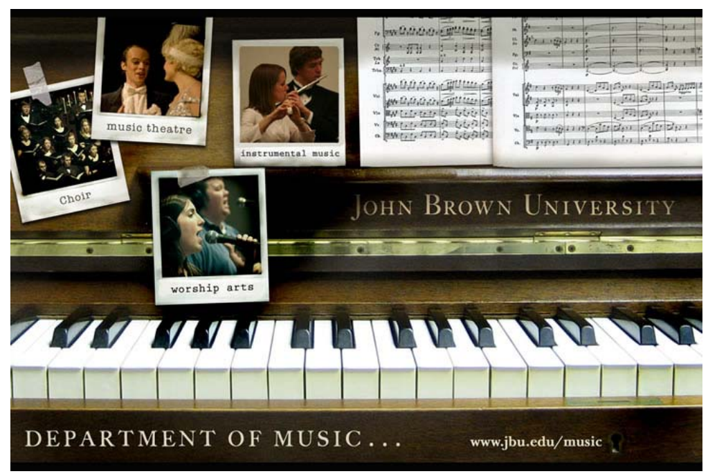
CLICK HERE to view these images in your web browser.