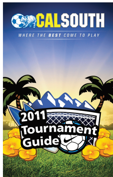
2011 COVER (Not to scale)