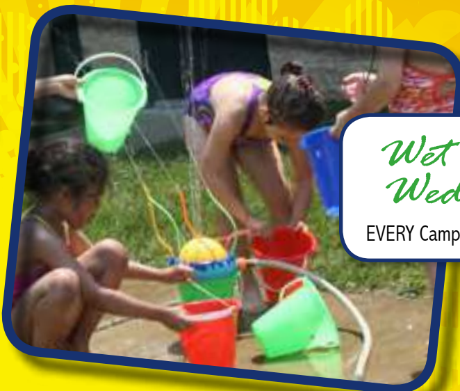
Wet & Wild Wednesdays