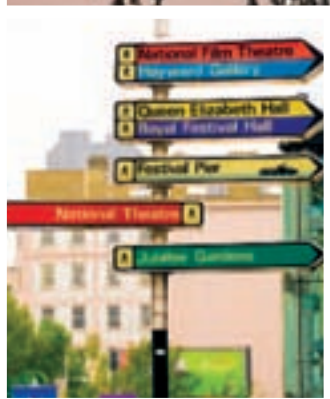
Top to bottom:

Presorted Standard U.S. Postage Paid AHI Travel