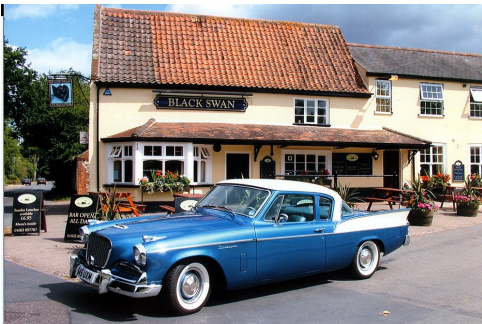
1958 Silver Hawk found in the U.S.

"... A beautiful car (referring to my '53). We have no sedans of that period in England. We do have a 1954 Champion Conestoga in Cambridge ... I have a 1957 President" and "a 1958 Silver Hawk. We have one member in London who owns a Speedster. London is too expensive for most people, especially with a large car. The Speedster owner rents a single garage from the local authority. A few years ago they offered him the option to buy the garage. At that time the price would have been around £50,000 ($100,000). He declined the offer and still rents."