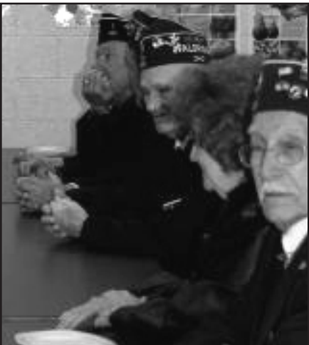
Lake Township veterans enjoy breakfast at Walbridge Elementary.

Day is, the different branches of service, and what it means to be a veteran. Near the end of the assembly, the children sang “We Love Our Flag” for the veterans. The assembly ended with each veteran being presented with a handmade “thank you” card that the children had created in art class.