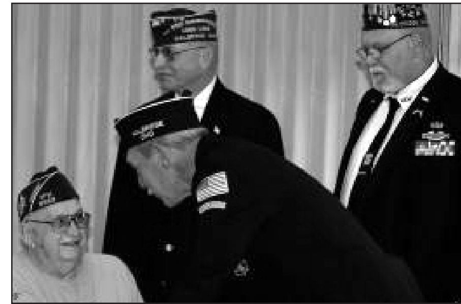
Veterans from the Walbridge VFW post enjoy conversation with an Honor Flight member.

December will continue with giving back to the community. The children will be collecting canned food for our annual food drive. The food drive will take place December 1st – December 11th. The classroom that collects the most food will earn a pizza party. On December 11th the Lake Township Fire Department will pick up the boxes of collected food at Walbridge Elementary.