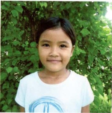
Dun EE Can Phone: 0408 32 77 99 Email : duneecan@gmail.com