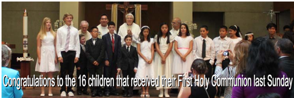
Congratulations to the 16 children that received their First Holy Communion last Sunday

Available for most 8:30 and 10:00 am Masses (1st thru 6th Grades only)