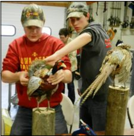
Participants mount a pheasant at our taxidermy workshop this fall.