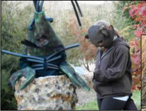
Over 100 people participated in our Halloween Hike! Left: crayfish & river otter, Below: red foxes