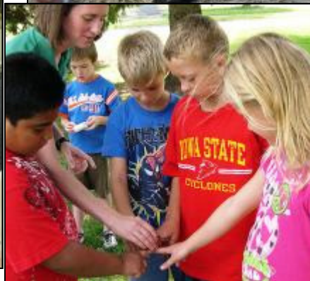
Briggs 3rd grade students release a monarch butterfly after helping tag it.