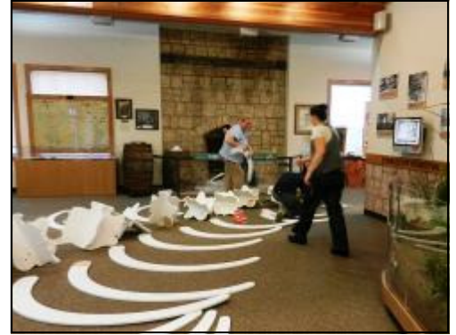
Staff enjoy putting together the giant snake skeleton—just one very large puzzle!