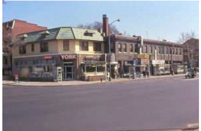
(Southeast corner of Georgia Avenue and Rock Creek Church Road, March, 1965)