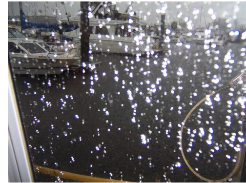
Hardly even sprinkled