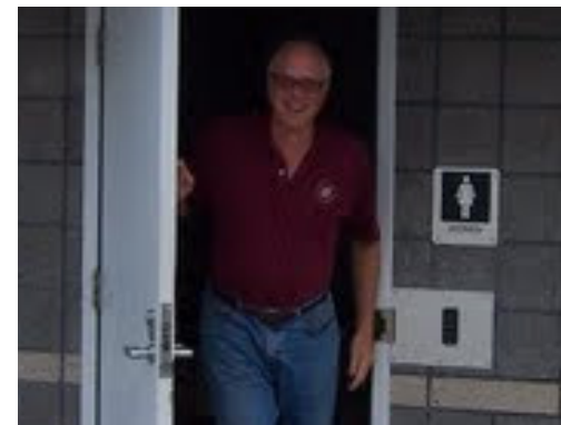
Commander flunks basic navigation