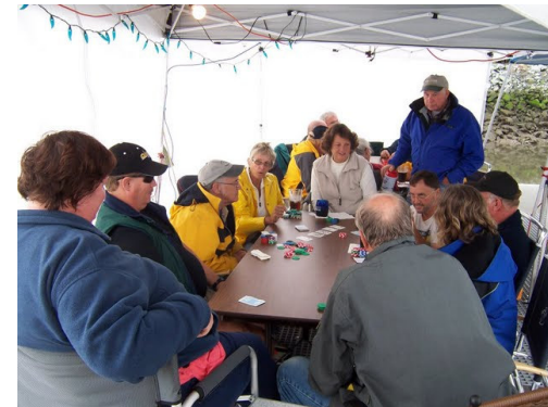
Leaving so soon??