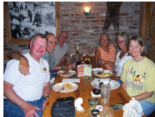
Hosting is such hard work!!