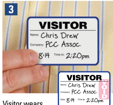
Visitor wears badge for easy identification.