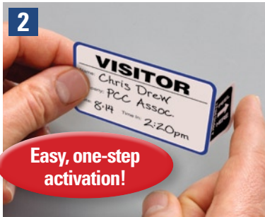
The color-changing badge is activated with just one simple fold.