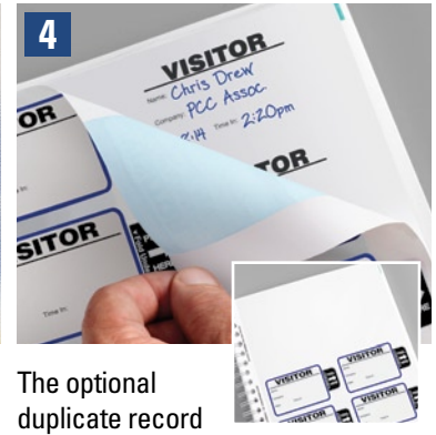
The optional duplicate record tracks your visitors automatically.