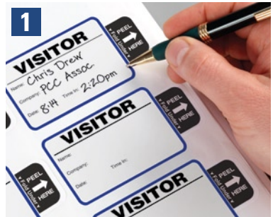
Visitor signs in on badge. (Actual badge is 2 7/8" x 1 7/8")