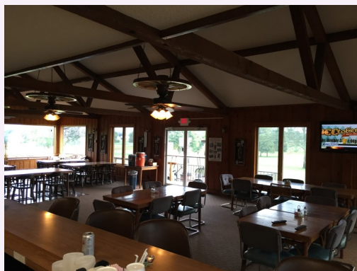
Inside the Clubhouse at the Carmi Country Club.