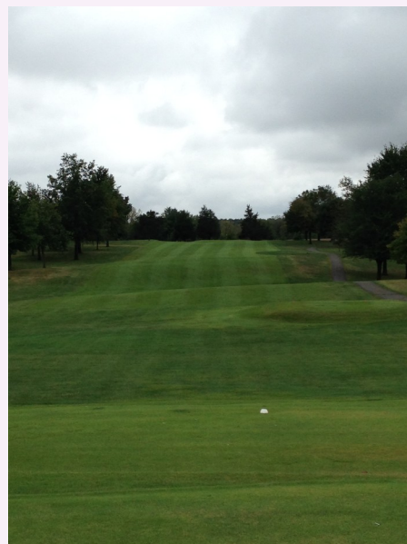
The Carmi Country Club provides one of the best golfing experiences in southern Illinois.