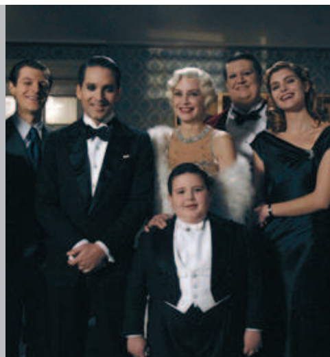
From L to R: The Innocents, A Magnificent Haunting