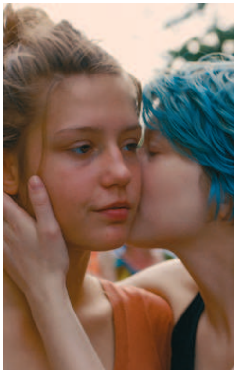
From L to R: Philomena, Blue is the Warmest Colour

USA/2013/136mins/15. Dir: Sophie Fiennes. With: Slavoj Žižek. Cultural theorist superstar Slavoj Žižek re-teams with director Sophie Fiennes ( The Pervert's Guide to Cinema ) for another wildly entertaining romp through the crossroads of cinema and philosophy. With infectious zeal and a voracious appetite for popular culture, Žižek literally goes inside some truly epochal movies, all the better to explore and expose how they reinforce prevailing ideologies. Titanic, Kinder Eggs, verité news footage, Beethoven's "Ode to Joy" and propaganda epics from Nazi Germany and Soviet Russia all inform Žižek's stimulating, provocative and often hilarious psychoanalytic-cinematic rant.