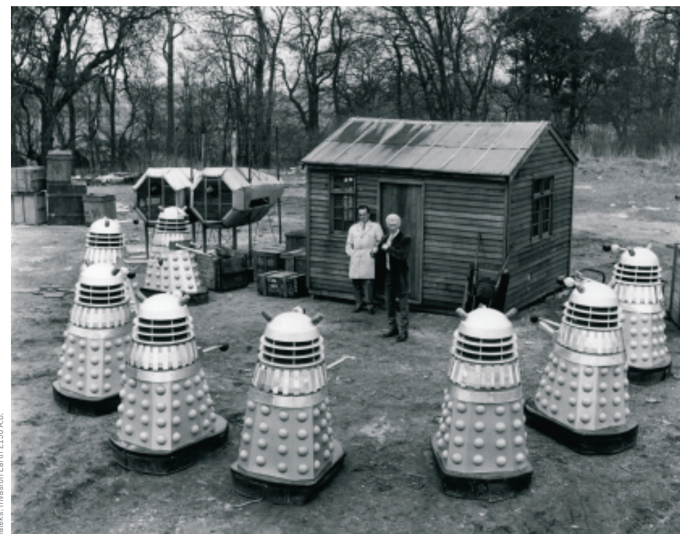
Daleks: Invasion Earth 2150 A.D.