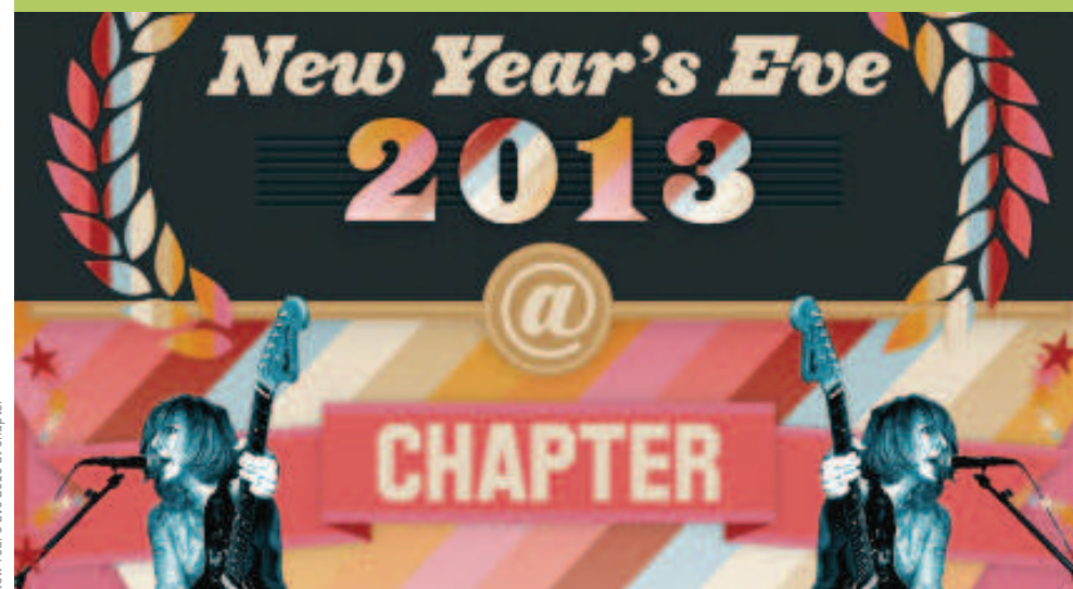
New Year's Eve 2013 at Chapter