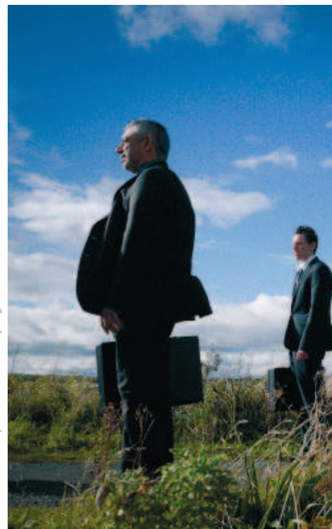
From L to R: Streetwise Opera: The Answer to Everything, Jeune & Jolie