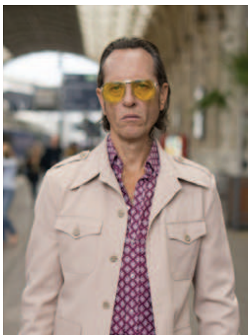
Above from top to bottom: Marius, Dom Hemingway

With Marius on a voyage across the South Seas, Fanny is left to her own devices back in Marseilles, easy prey for the sad, gentle Panisse. It becomes apparent that Fanny is carrying Marius' baby, and with the help of her family and Marius' father Cesar, they work out a deal with Panisse, thus ensuring financial security for her and her son, while avoiding the shame of raising a fatherless child. But what will happen when Marius comes back from his journey?