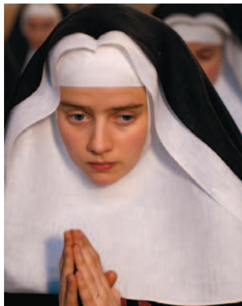
From L to R: The Patience Stone, The Nun