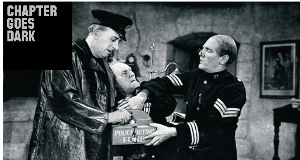
Ask a Policeman