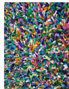
Image from http://www.k-state.edu/atid-sustainability/Student%20Pages/Redesign_Project_Page.html

Have so many T-Shirts you don't know what to do with 'em? Bring them to the library and create a T-Shirt rug! We'll shred the T-Shirts and create great-looking, soft rugs that are perfect for bedrooms, bathrooms or any other room you like. Don't have T-Shirts to bring—no problem! We'll have plenty for you to use! FREE! Grades 6-12