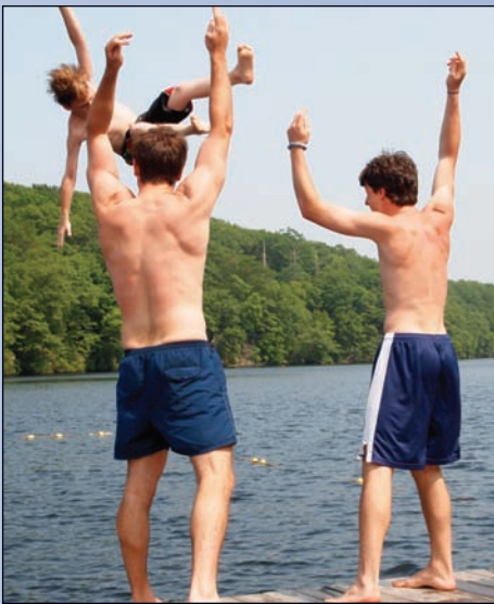
Get tossed into the lake