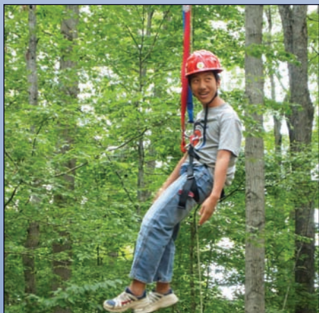
Zip line through the trees

es are included here with our thanks and appreciation to all those who so learning and activities possible.