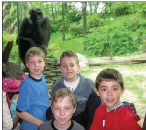
Boys at the zoo