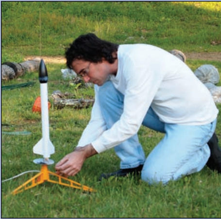
Build & launch a rocket

What can a boy do at camp? A few of the good times generously give to make camp, scholarships, tours,