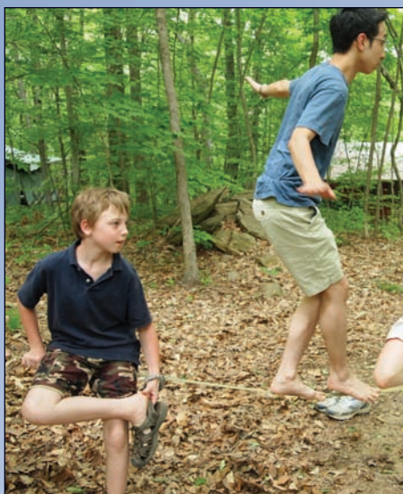
Walk a tight rope