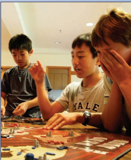
Play a game