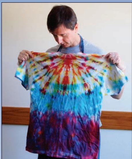
Tie-dye a shirt