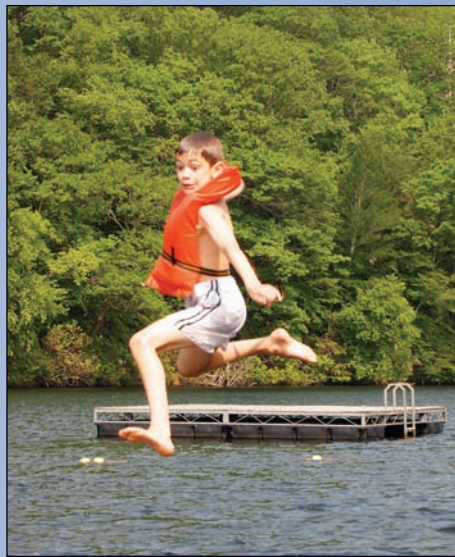
Jump in the lake