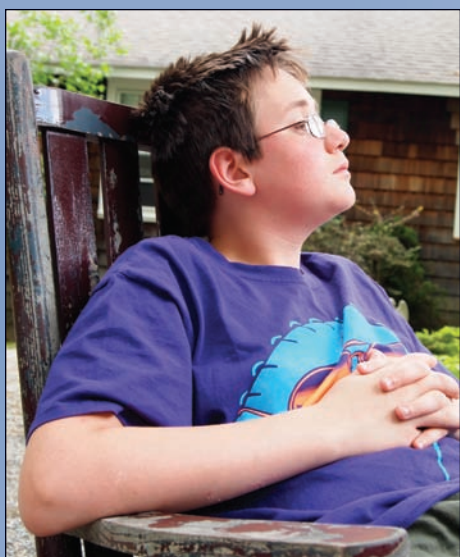
Sit and think