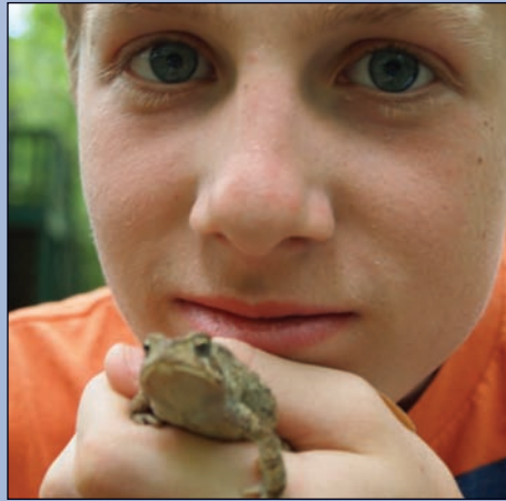
Catch a frog