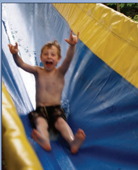
Slide into the lake