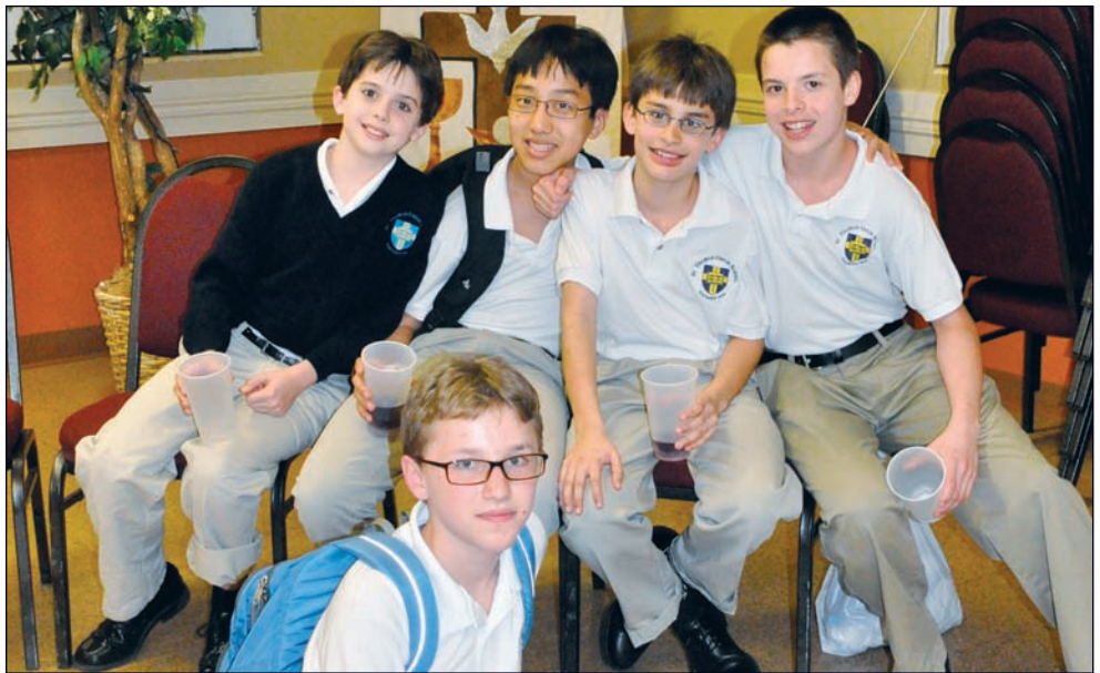
Boys relax at a post-concert reception while on tour