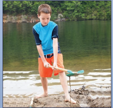
Dig a hole