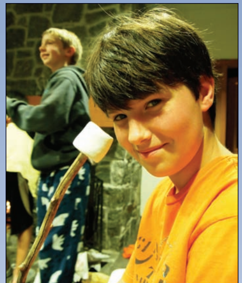
Roast a marshmallow