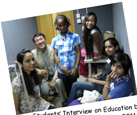
Students' Interview on Education by Commercial Radio on 3rd Aug 2011.