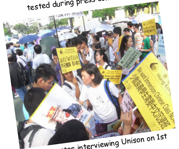
A newspaper reporter interviewing Unison on 1st July Rally.