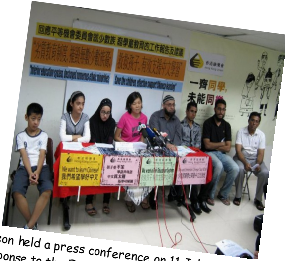
Unison held a press conference on 11 July, 11 to have Response to the Equal Opportunities Commission on the work of education for ethnic minorities report and recommendations.