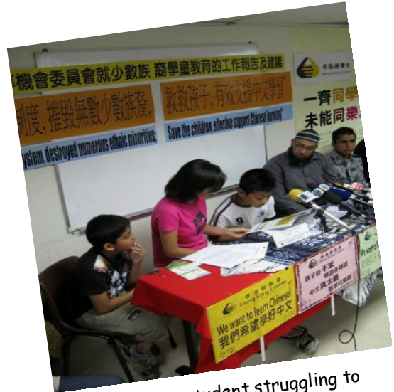
One Nepalese student struggling to read simplest level of Chinese when tested during press conference.