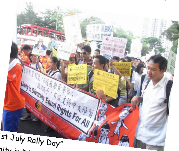
"1st July Rally Day" Unity in Diversity, Equal Rights for All