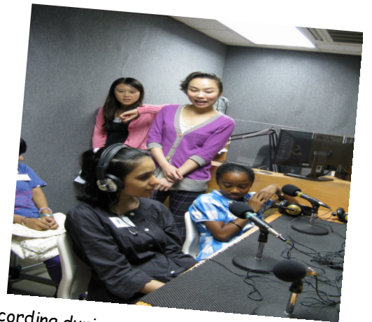
Recording during the Interview.