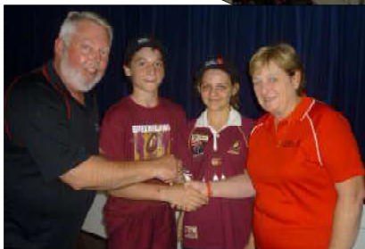
Morcombe Family visit.