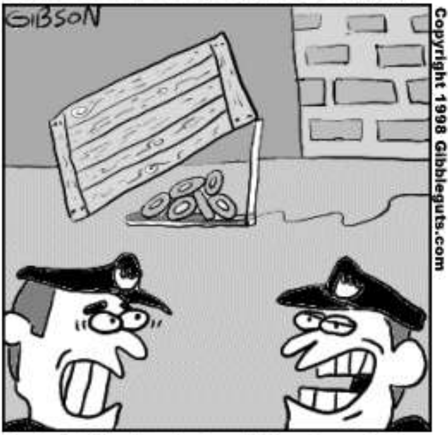
I don't like the look of this...It could be a trap.

Thanks goes out to the following Businesses: