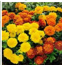
Mix & Solids