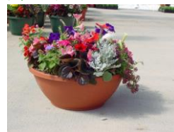
Color Bowls Sun & Shade