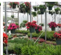
Baskets Sun & Shade