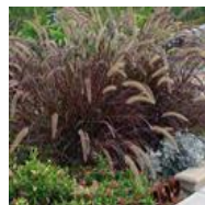
Purple Fountain Grass