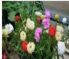
Mix & Solids