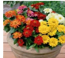
Short Stuff Mix