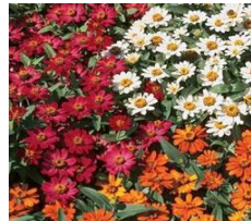
Prof Mix & Solids