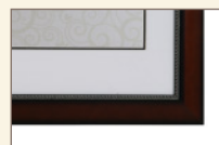
Brown Frame with Texture