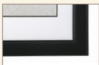
Black Frame with Texture