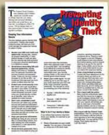
E060 Preventing Identity Theft WHAT: Keeping personal information secure. Monitoring credit properly; shredding and protecting; guarding your SSN; responding to mail and e-mail solicitations; password problems; credit bureaus; responding to suspicious activity. WHEN TO USE: Waiting rooms, seminars.