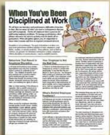
E056 When You've Been Disciplined at Work WHAT: Discipline isn't punishment; causes of employee discipline; what to do; how to respond; seeing an opportunity for change; why the employer isn't the "bad guy"; responding with the right attitude; using the EAP. WHEN TO USE: Individual counseling sessions.

$17 each - or save $58 and buy all for $197!