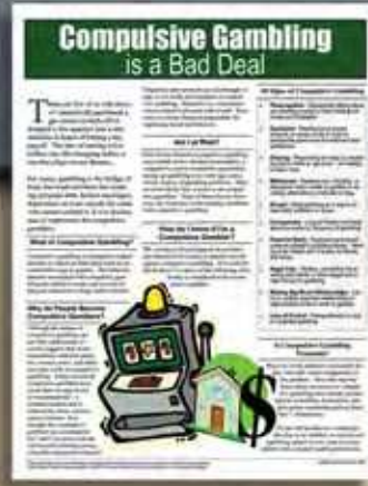
E051 Compulsive Gambling is a Bad Deal WHAT: What is compulsive gambling; why people become gamblers. Am I at risk? Self-diagnosis, signs and symptoms. Treatment and recovery of compulsive gambling addiction. WHEN TO USE: Individual counseling, health fairs, family counseling.