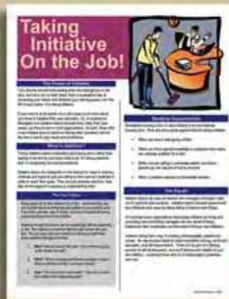
E058 Taking Initiative On the Job WHAT: Why initiative is powerful—and it's free! What is initiative; why you don't take initiative; proactive initiative vs. initiative out of fear. Spotting opportunities for initiative; the payoffs for everyone. WHEN TO USE: Waiting rooms; team building.