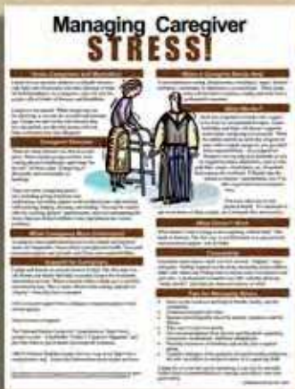
E057 Managing Caregiver Stress! WHAT: Caregivers are special, but have important needs. Types of stress; caregiver needs; avoiding denial of needs; support of caregivers; when you need help; what works!; what doesn't work!; counseling; tips. HERE TO USE: Counseling, waiting rooms.

$17 each - or save $58 and buy all for $197!