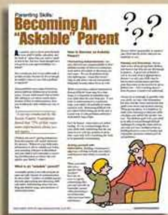
E048 Becoming an "Askable" Parent WHAT: Children who aren't getting answers from their parents will go somewhere else. What is an "askable parent"? Becoming receptive. Developing skills in honesty and directness. Arming yourself with information and understanding "TMI". WHEN TO USE: Client counseling sessions EAP waiting areas, health fairs

ALL PROGRAMS AND PRODUCTS COMPLETE WITH 100% MONEY-BACK GUARANTEE!