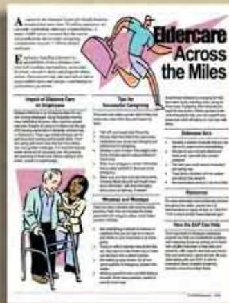
E059 Eldercare Across the Miles WHAT: Stressors faced by employees with long-distance eldercare responsibilities; tips for caregivers and family; mistakes and missteps of family members; what elderly persons should do; resources. WHEN TO USE: Counseling sessions, brownbag presentations.