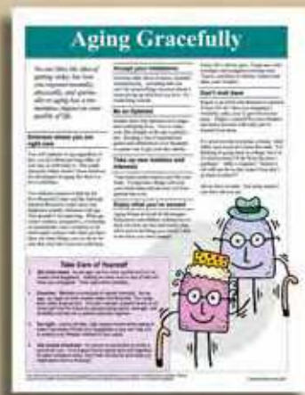
E046 Aging Gracefully WHAT: Embracing the present; accepting limitations without elimination; moderating versus giving up on things you love; being an optimist; new hobbies; taking care of yourself; tips on enjoying life; not looking back; much more. WHERE TO USE: Client sessions, brown-bag luncheons

Fact sheets come on one CD in MS Publisher, MSWord, and a PDF along with a reproducible hard copy in a top-loading sheet protector, and a plastic storage case. You can customize the fact sheets by adding your EAP name and phone number. E-mail them, create your own PDFs, or put them on a password protected Web site. Use them in waiting rooms, at health fairs, at client sessions and orientations, on bulletin boards.