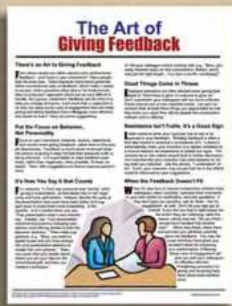
E047 The Art of Giving Feedback WHAT: The art of giving feedback to others; focusing on behavior, not personalities; what to say, how you say it; the sandwich technique; when others resist; when feedback doesn't fit; keeping egos out of feedback. WHEN TO USE: Team building, client sessions, off-site retreats, conflict resolution.