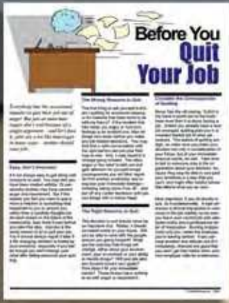
E049 Before You Quit Your Job WHAT: Avoiding overreaction to conflict; the right reasons to quit; considering the consequences of quitting a job; being professional in letting go; not burning bridges; more. WHERE TO USE: Counseling and individual client sessions, waiting rooms.