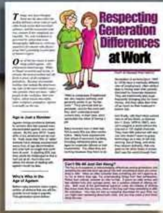
E050 Respecting Generational Differences WHAT: "Ageism" and its cost; attitudes and values of different generations- boomers, X, Y and beyond; why we can't get along, and how to start making it happen. WHERE TO USE: Conflict resolution, individual sessions, brown-bag seminars.