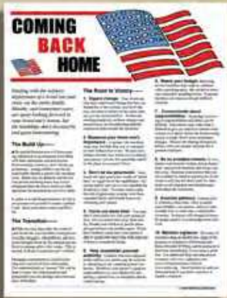
E053 Coming Back Home WHAT: Managing the emotional build-up of coming home from; transitions; expectations; getting back to normal life; Ten powerful tips for families and key issues of reuniting. WHERE TO USE: Family sessions, group work, health fairs, waiting rooms.