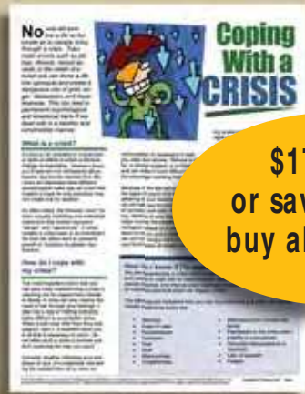
E054 Coping with a Crisis WHAT: Crisis versus trauma. Definition and "what works" in managing crises. Is it a crisis? Staying mobilized. Steps for coping. Managing disruption. Keeping structure in your life. Decision making. Signs that crisis is affecting you. WHERE TO USE: Counseling sessions Groups.