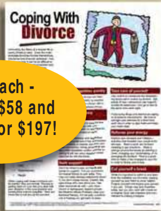
E055 Coping with Divorce WHAT: Emotions and loss; legalities; avoiding unnecessary conflict; seeking support; taking care of yourself; refocusing your energy; avoiding unhealthy coping behaviors; forgiving yourself. Moving forward. WHEN TO USE: Client sessions, counseling, waiting rooms.