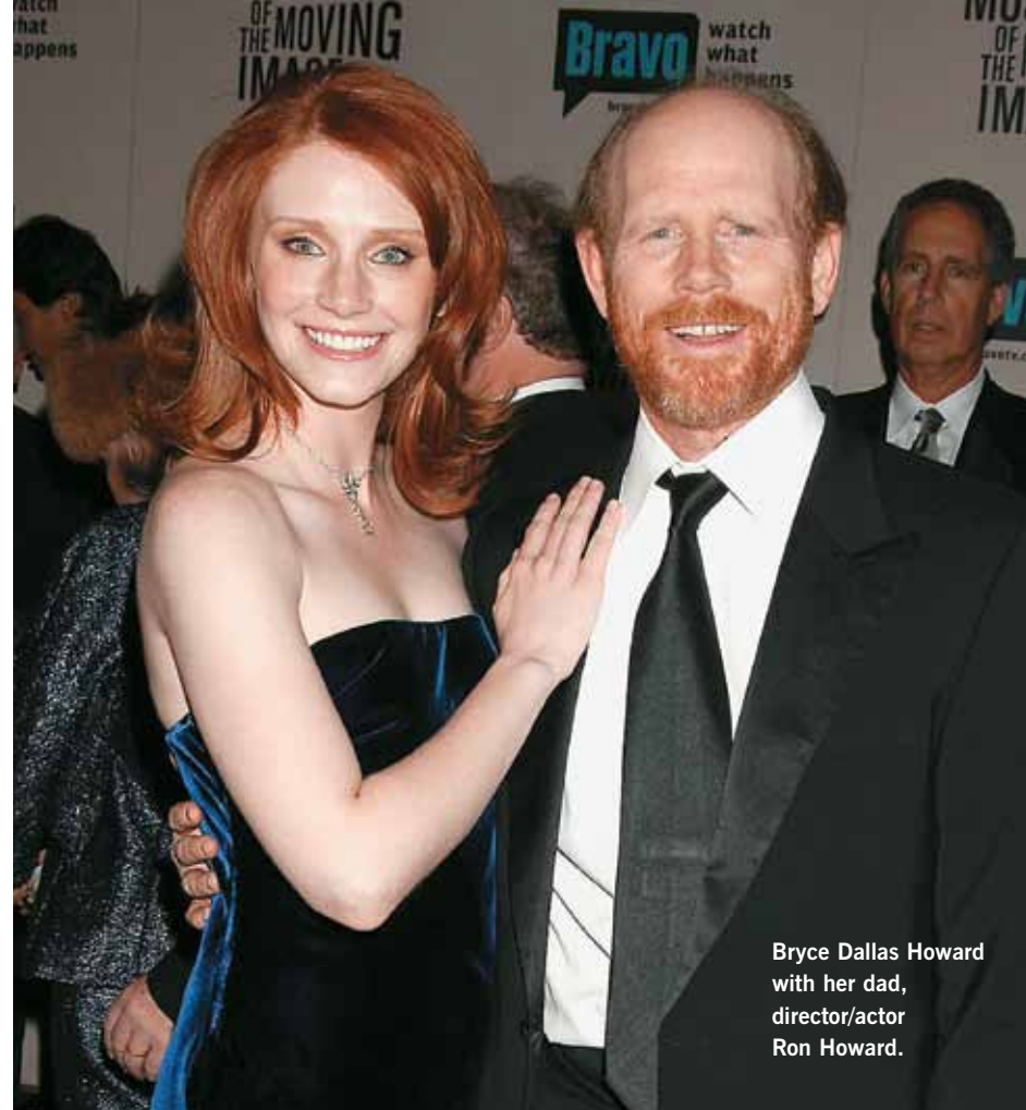
Bryce Dallas Howard with her dad, director/actor Ron Howard.

The “despicable human being” is nasty Hilly Holbrook, the meanest creature of fiction to appear since race-baiting Bob Ewell ruined lives in To Kill a Mockingbird . Sweet-as-a-snake Hilly is a society princess