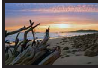
Santa Barbara Beach