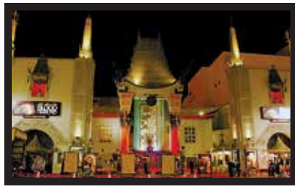
Mann's Chinese Theatre