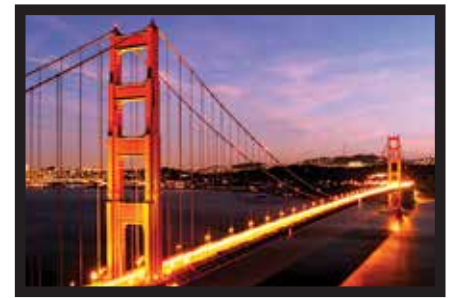
Golden Gate Bridge

*Deduct $50 per person when paying by cash or check