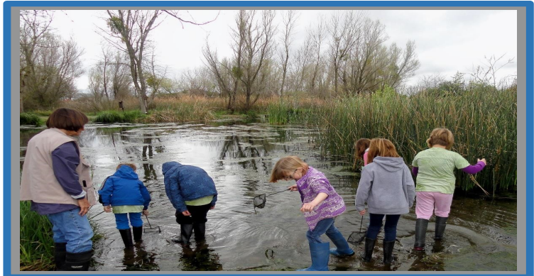
Students experience Yolo Basin outdoor education program.