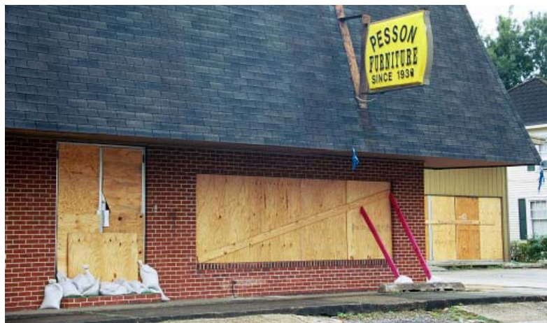
A business is boarded up and sandbags are placed at the base of doors in anticipation of a hurricane.