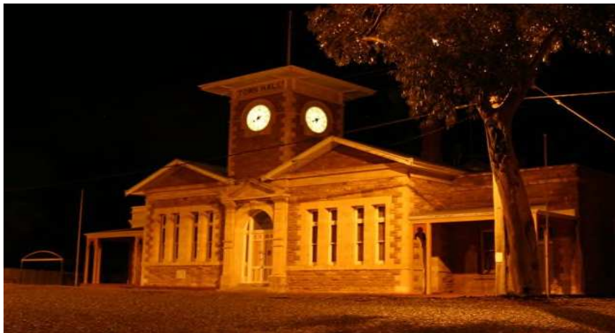
Menzies Shire Offices